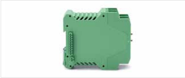
VT CamCtrl side view