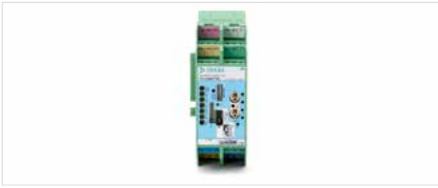
VT CamCtrl front view