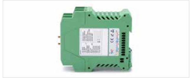
VT CamCtrl side view

DEKRA Visatec GmbH Gewerbepark 7, 87477 Sulzberg/See Germany Tel. + 49.8376.9215 0 info.dvg@dekra.com