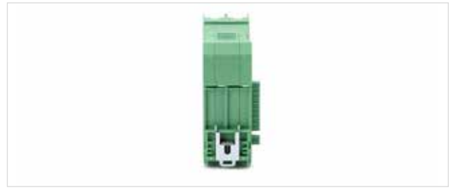
VT CamCtrl back view